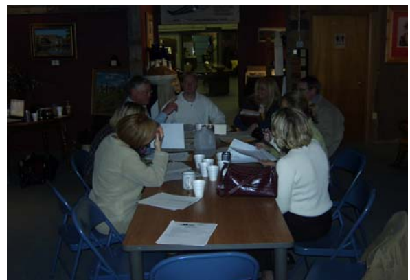
Main Street Guymon committee volunteers busy planning

For more information on becoming a member of Main Street Guymon, please contact the MSG office at 338-6246 or visit us online at www.mainstreetguymon.com