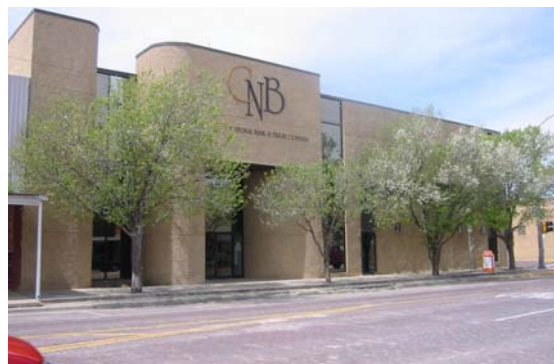
Location at 5th and Main