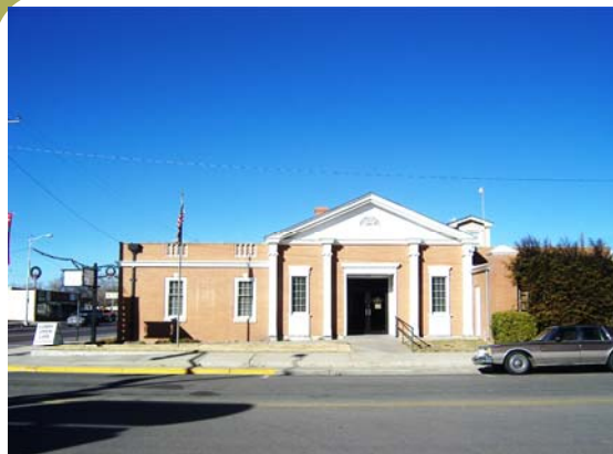
Location at 6th and Main